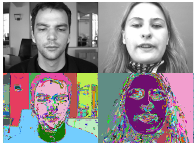
Fig 5. Example of fragmentation algorithm working

As a result of the algorithm matrix U which contains all image fragments will be constructed.