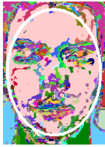
Fig 3. Ratio of approximating ellipse and real fragment.

other hand pick out permissible objects. To do this it's enough to estimate accuracy of the constructed approximation.