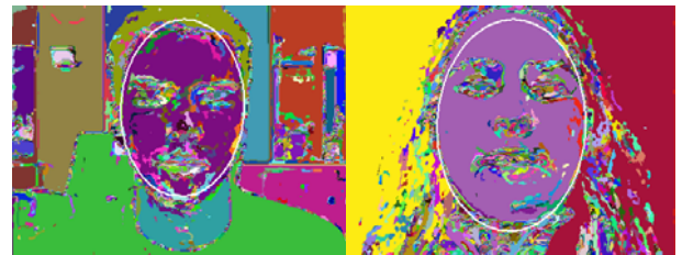
Fig. 2. Ellipse approximations of face-like fragments

It's easy to see that the algorithm finds an approximating ellipse for any fragment. At the same time, the accuracy of approximation essentially depends on the shape of the fragment: the closer fragment to ellipse the better approximation is. These properties of the algorithm relies, on the one hand, regulated degree of feasibility of hypothesis that the face has an elliptic shape and on the