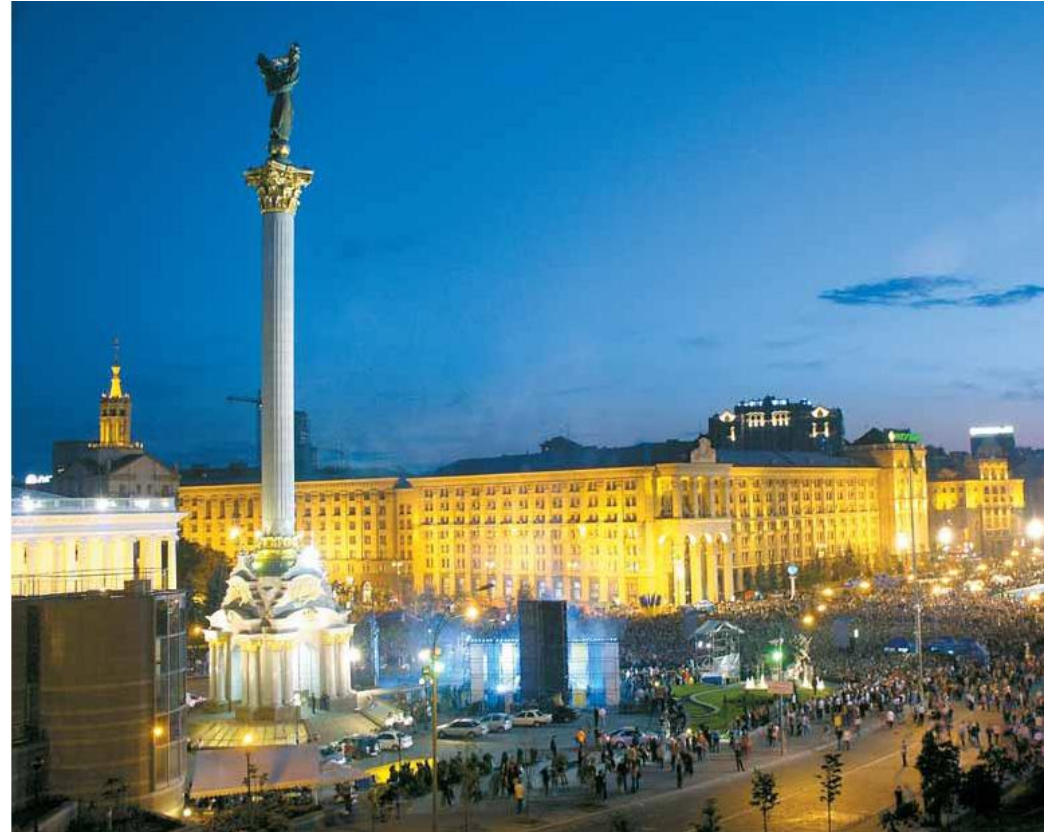
Kyiv Independence Square (Maidan)