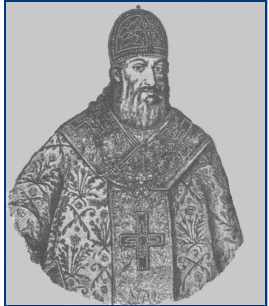
Petro Mohyla - founder of the Academy