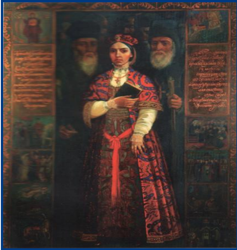
Halshka Hulevychivna – celebrated noblewoman, who gifted the Kyiv Brotherhood School, forerunner of Kyiv-Mohyla College and Kyiv-Mohyla Academy with one of her houses in old part of Kyiv - Podil